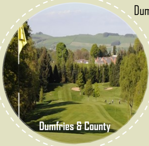
Dumfries & County

Tailor your own 2 nights, dinner, bed & breakfast plus 2 rounds of golf Midweek or Weekend at your chosen golf courses from the list below.